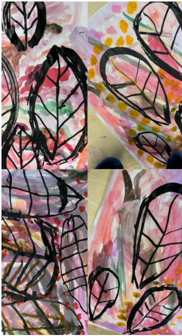
Leaf studies using watercolours and inks, created by Art Club.