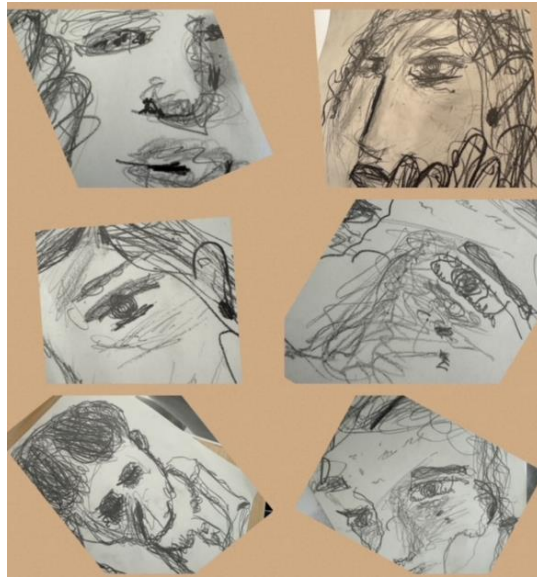
Work on portraiture using graphite and art pencils, completed by Class 4.